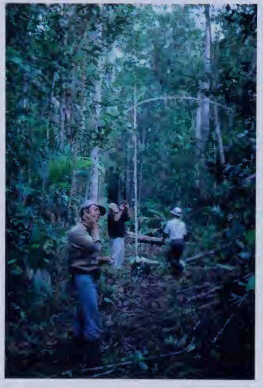
Figure 4 Rainforest near pit 8.